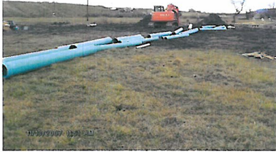
Installation of floodplain/riparian pipelines on the east side of the river November 2007.