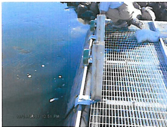
Installation of fish screen cleaning brushes.