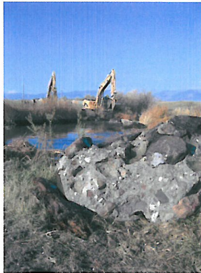
Removal of the Araujo Dam