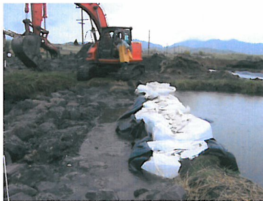
Removal of the earthen and sandbag dams.