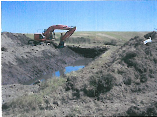
Excavation of bypass channel