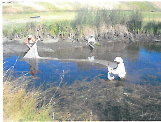
DFG coordinated fish rescue activities (no salmonids were found).