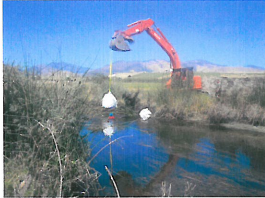
Placement of sandbags as a temporary dam to dewater channel.