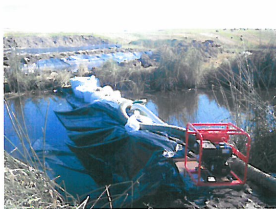
Pumps assisted with dewatering channel.