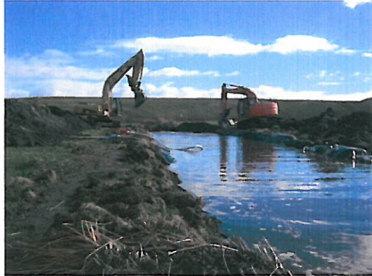
Backfill of temporary bypass channel.