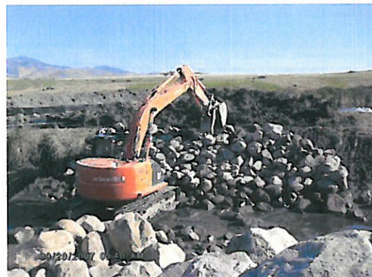
Construction of boulder riffle.