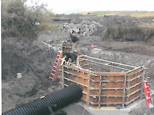
Forming of fish screen.