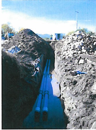
Installation of pipes under the river channel.