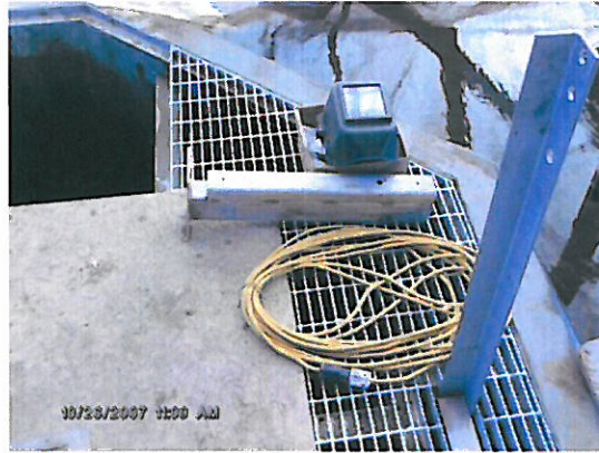
Construction of the fish screen and grating.